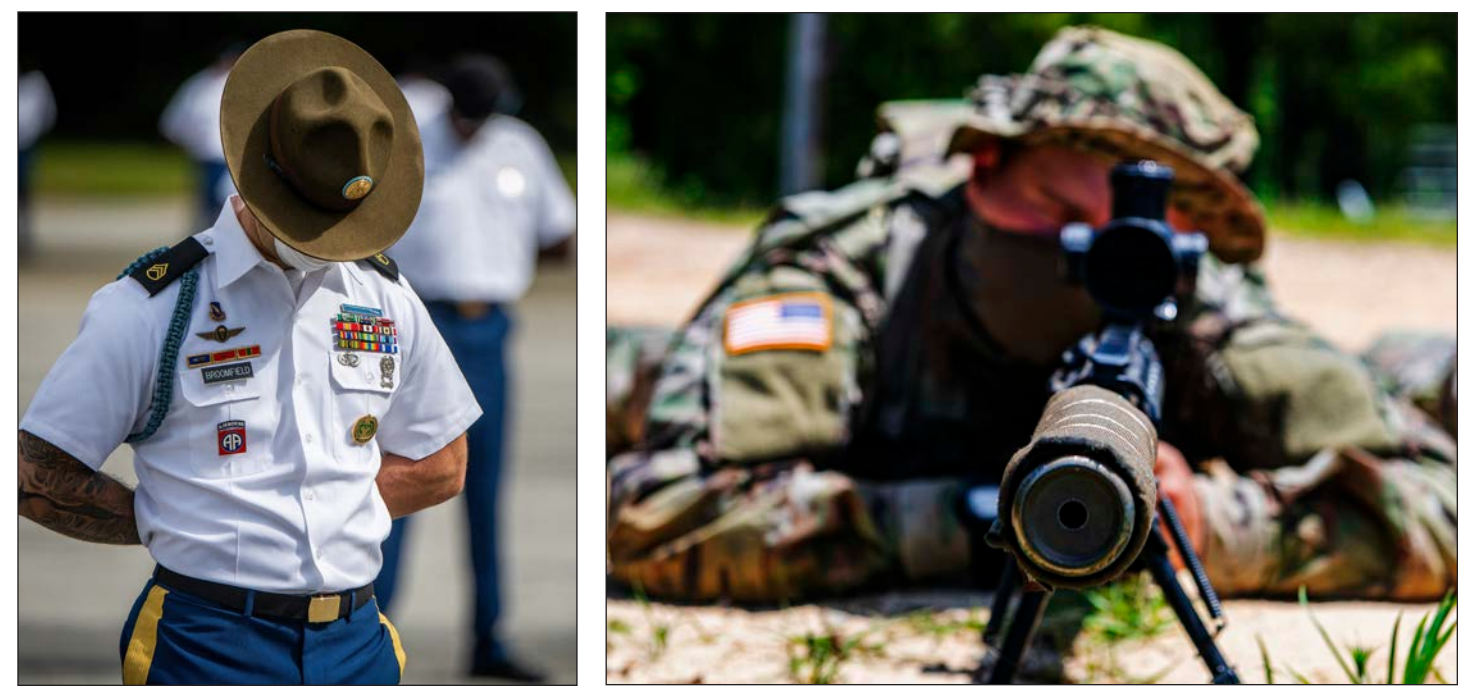
Above left, a drill sergeant from the 3rd Battalion, 47th Infantry Regiment wears a protective face mask during a One Station Unit Training graduation on 24 April 2020 at Kanell Field on Fort Benning. Above right, a sniper student dry fires his rifle during training at the U.S. Army Sniper Course. Soldiers practice safety while ensuring correct execution of the training.

coverings, restriction of personal and unit movement, proactive unit command information programs, and other measures have proven helpful. The MCoE approach to mitigating COVID-19 has been both systematic and comprehensive, drawing upon the elements and strategies that were effective in earlier pandemics and relied on shared information and collaboration, both internal to the Department of Defense and across federal and state agencies.